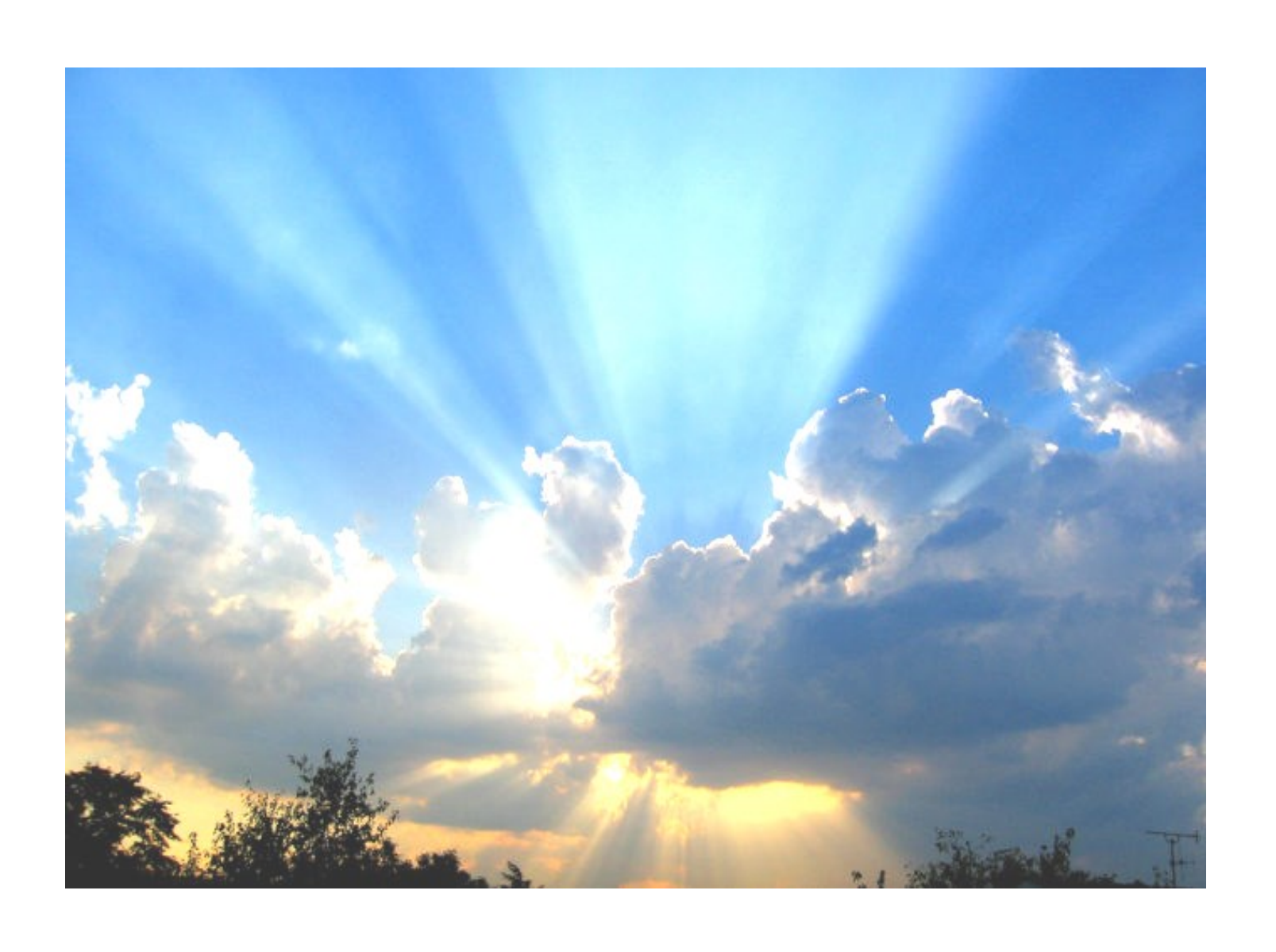
Ps 19:1a The heavens declare the glory of God;