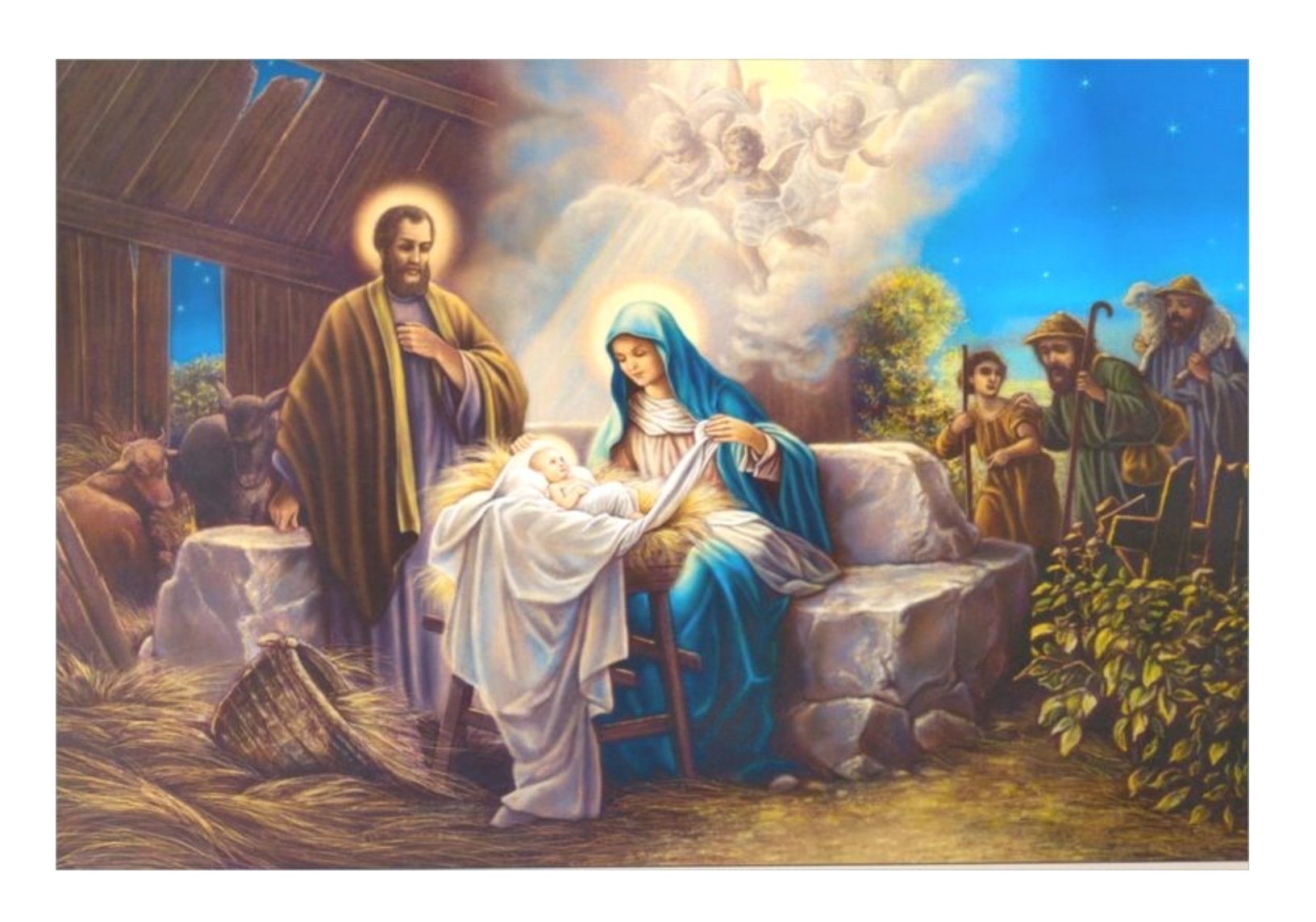
Jn. 1:12 ...to those who believed in his name, he gave the right to become children of God—